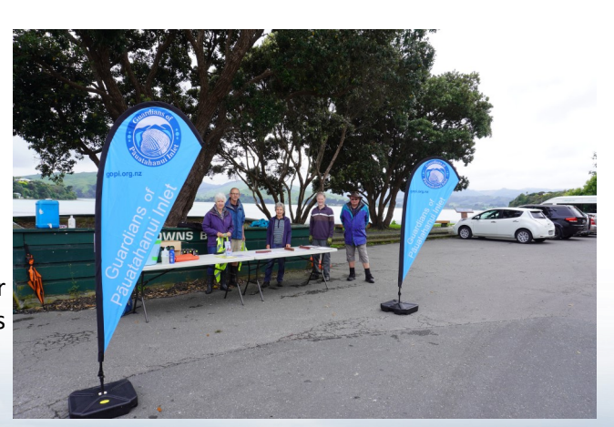
Last year's Clean-up registration at Browns Bay

Please mark this morning in your diary. Your participation in helping to keep the Inlet clean is much appreciated.