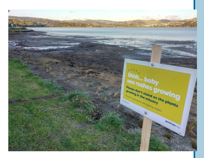
Motukaraka Point, one year on.