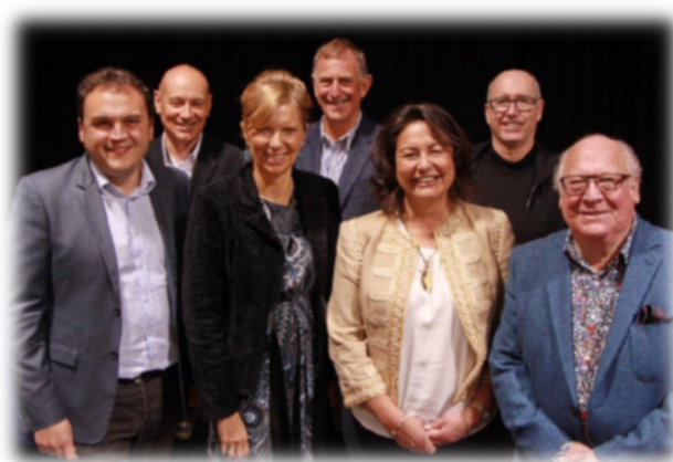
Members of the debating teams, from the left:

The debate and its accompanying auction was a fundraising event and raised $3,765. This money is to be used for information boards on Te Ara Piko – and we can only hope that the information never relates to the departure time of the next flight!